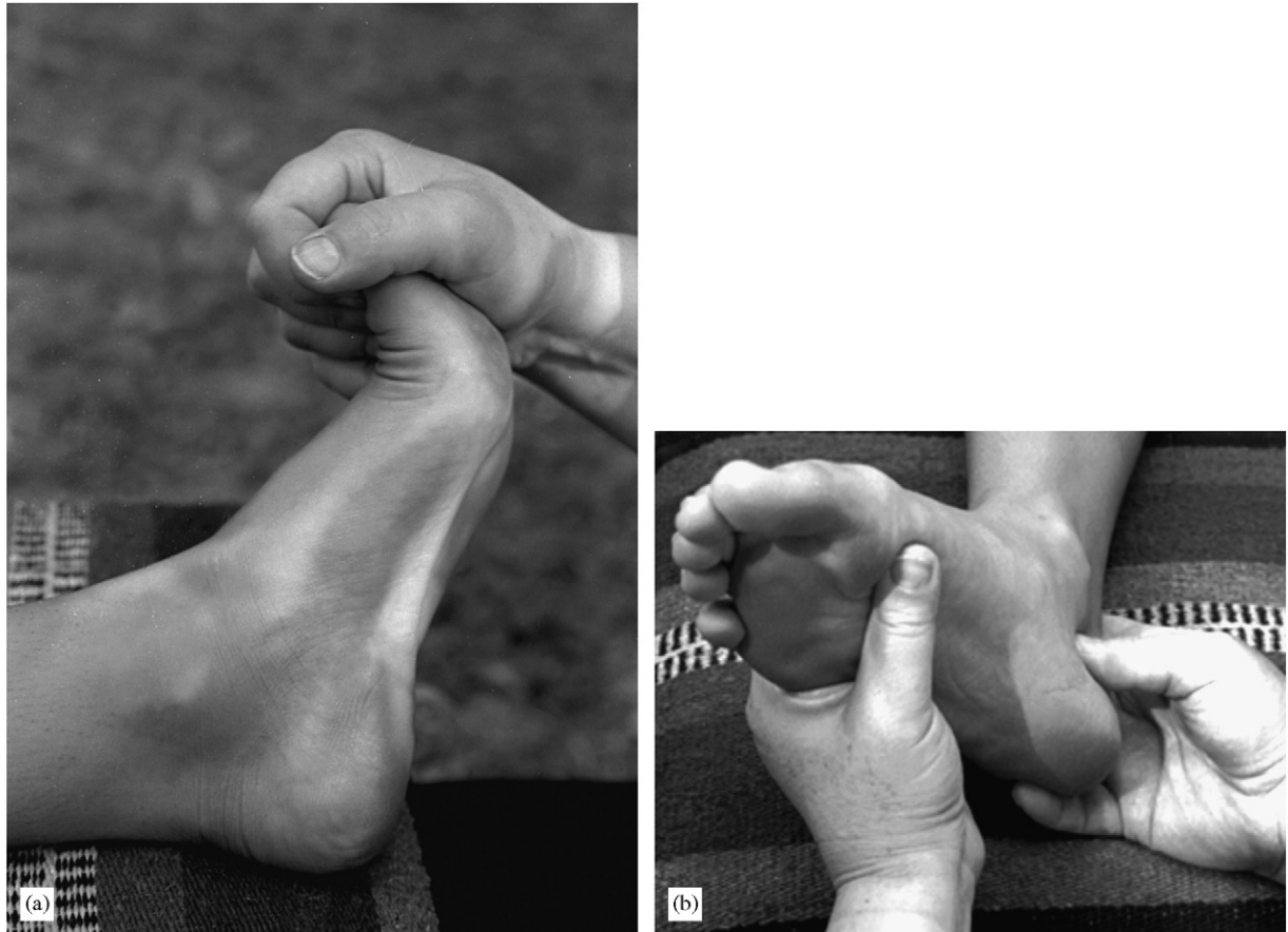
Figure 8.

Placement. With thumb, apply pressure to ball of foot; pressure point around complete edge of bone below and around large toe; rajasic or tamasic touch. Opposite hand applies pressure to hallucis longus. Repeat both sides (Fig. 8).