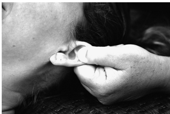
Figure 4 (Photographs by Amber Cole of Cole Photography).

Placement. Thumb and forefinger applying pressure and gently stretching around whole ear; emphasis on eliciting and holding areas of pinpoint pain and contact where vagal nerve surfaces; rajasic touch (Fig. 4).