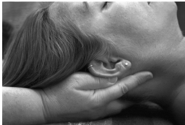
Figure 1 (Photographs by Amber Cole of Cole Photography).

Placement. Hands cradle occipital bone at base of skull; right hand under left; thumbs along mastoid process; index fingers along side of neck; satvic touch (Fig. 1).