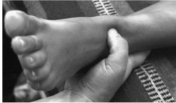
Figure 9 (Photographs by Amber Cole of Cole Photography).

Placement. Thumb of right hand is placed on the top of the right foot in the hollow between the ankle bones; left hand rests on the bottom of the rib cage with fingers below edge; depending on the comfort of client, the therapist may slowly move left hand medially to laterally on rib cage, pressing up underneath with fingers to stretch diaphragm and release restriction. satvic, or rajasic touch (Fig. 9).