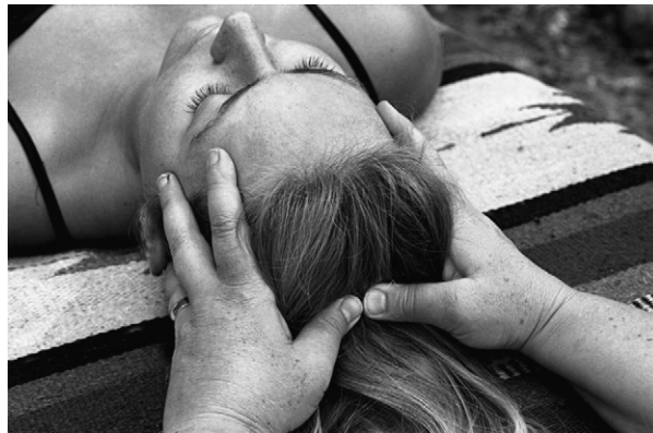
Figure 10 (Photographs by Amber Cole of Cole Photography).

Polarity therapy. facilitates full body and spinal relaxation, offering final release of tension of the head; may facilitate trance state and hypnagogic imagery; encourages flow of cerebrospinal fluid and etheric energies; deep balance of central nervous system and parasympathetic nervous system; synchronizes right and left hemispheres of the brain (Fig. 10).