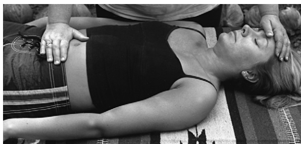
Figure 6.

Placement. Left hand on forehead with thumb position just above eyebrows and right hand on lower quadrant midline of abdomen; slow rhythmic rocking of abdomen with right hand, keeping left hand stationary; satvic touch (Fig. 6).