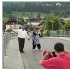
Bollywood Draws Indians to Switzerland