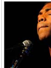
Guarding a Legacy From Nigeria to Broadway

Home | World | U.S. | N.Y. / Region | Business | Technology | Science | Health | Sports | Opinion | Arts | Style | Travel | Jobs | Real Estate | Autos | Back to