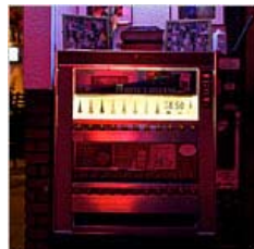
A Fixture That Became a Rarity