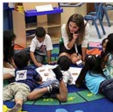
A Chosen Few Are Teaching for America