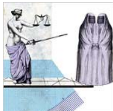
The Stone: 'Burqa Bans' by Martha Nussbaum